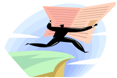
Before you jump off the cliff with a new technology wouldn't you like to know what's down there?